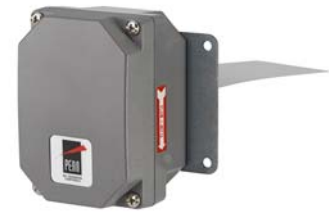
F262 Airflow Control