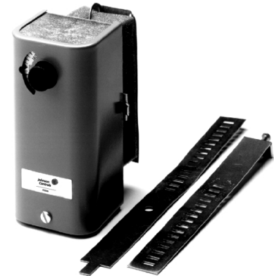
A19D Series Temperature Control

Typical A19D control applications include high temperature detection on boiler applications and low temperature detection on unit heaters coil applications.