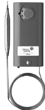
A19AAB Temperature Control