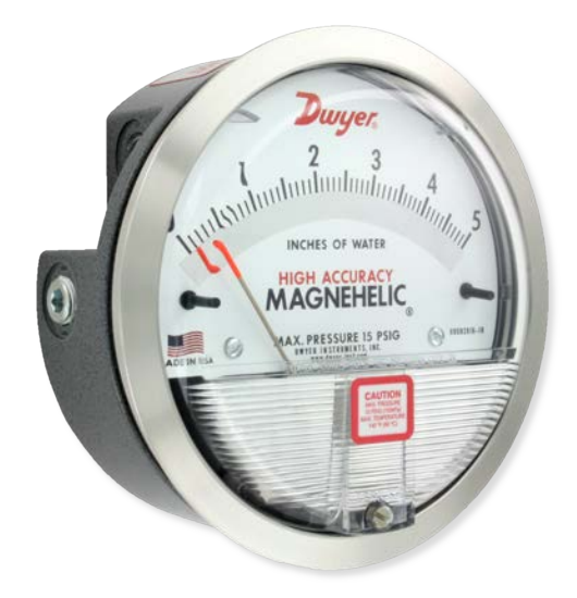
Note: Shown with optional -SS bezel