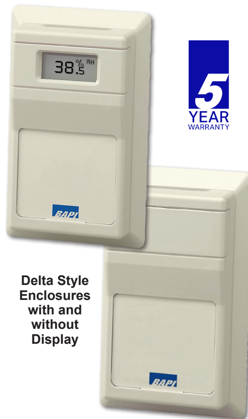
Delta Style Enclosures with and without Display

The unit is available with the entire line of BAPI temperature sensors. If a temperature transmitter and humidity transmitter are desired, then see the "X-Combo" Unit on pages B10-11 of this section.