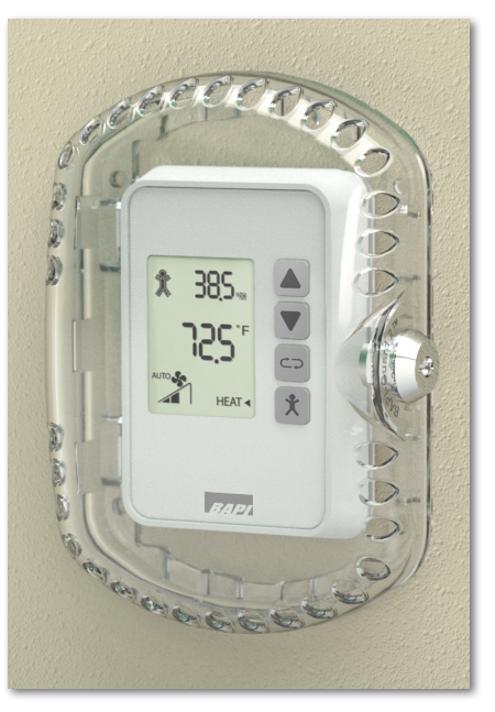
BAPI-Guard 2 Mounted Over a BAPI-Stat "Quantum" Sensor