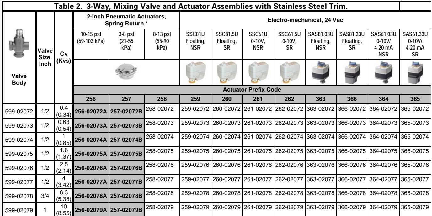
Table 2. 3-Way, Mixing Valve and Actuator Assemblies with Stainless Steel Trim.

* Product numbers in gray shading are available as assemblies only.