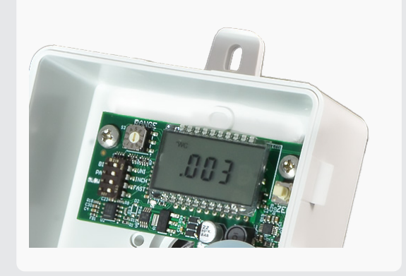
Ten field selectable ranges for high resolution