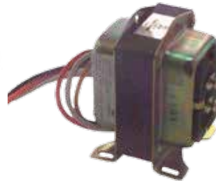
AT140A / AT150A