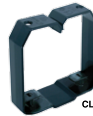
CL Wire Retainer