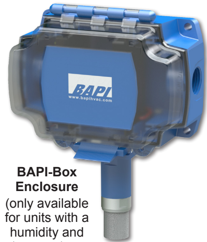
BAPI-Box Enclosure (only available for units with a humidity and temperature transmitter)