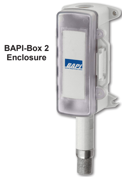
BAPI-Box 2 Enclosure